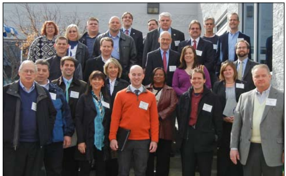
The Group on the Lowe's tour.